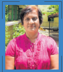
Louise Paris Amounts raised in support of 'Association of People with Disability' is ₹ 2,18,751