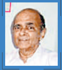
G M Row Amounts raised in support of 'Anga Karunya Kendra' - ₹ 1,77,501