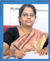
Shanigar Amounts raised in support of 'Association of People with Disability' is ₹ 3,00,229